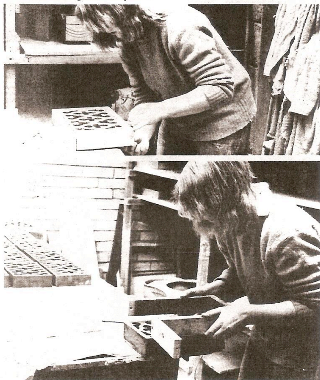
BELOW TOP Separating clay from wood after the box has been unscrewed and the template removed. BOTTOM Removing the box frame